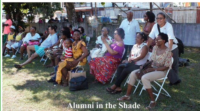
Alumni in the Shade