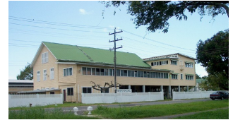
The Bishops' High School Old Students' Association

President Bishops' High School Old Students' Association (BHSOSA) 2015-2016