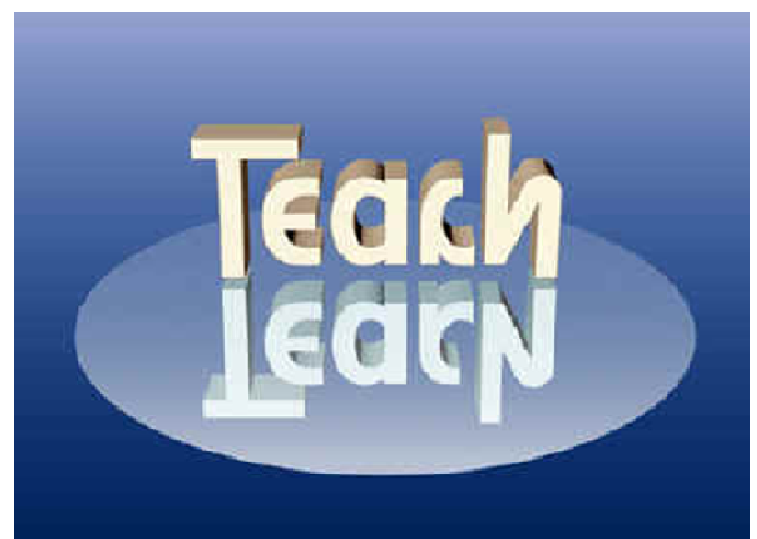
The word TEACH reflects as LEARN.

Test your eyesight. Is what you see really what you get? Have a look at the picture below. What do you see?