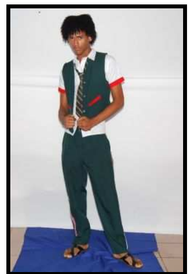
Facts 2 Model showcasing a redesigned Bishops' High Male Uniform: Shown during preliminary round in May 2008