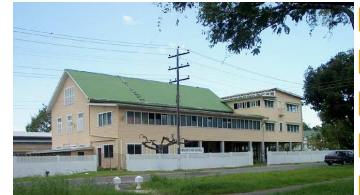
The Bishops' High School