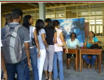
Young ones queue for entry