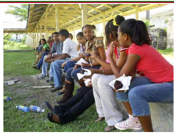
On the catwalk—bottles?