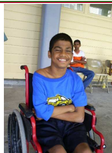
A guest—all smiles